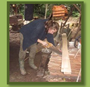
Helping in construction

At other times we were lucky to have the whole house full, and got many things done. It is great to see how everyone helps with everything. You don't need to have special expertise, just willingness to learn and do new things.